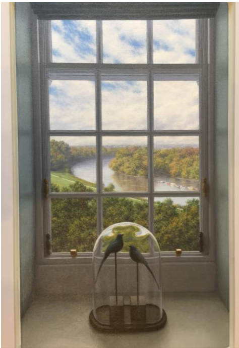
The View: Through a Window by Steve Whitehead.

The stunning collection of over 50 original works of art, including iconic views of the Thames as immortalised by Turner, is open from 4th April until 4th May by appointment through Lorna Votier The accompanying book showcasing all the works of art is available to buy at a cost of £20.