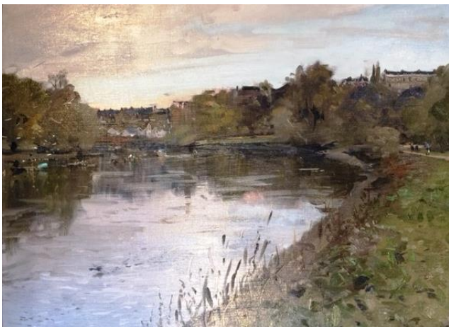
Artist Peter Brown Title: The Mallard takes off, Richmond Size: 30.5cm x 40.5cm Medium: Oil on Board Price: £4,250