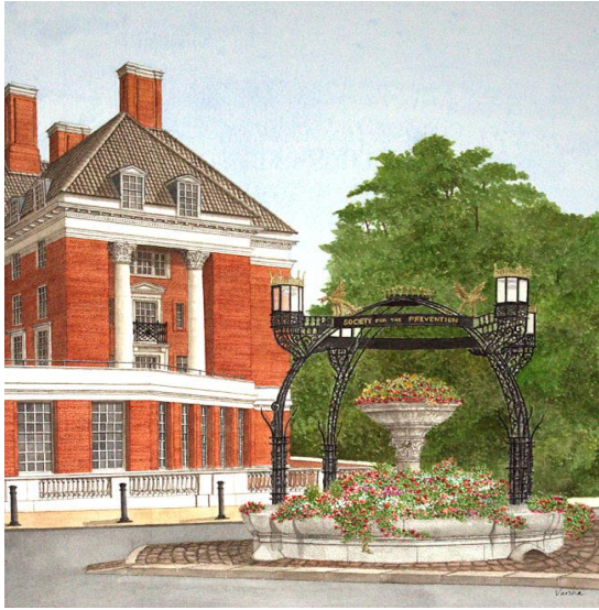
Artist Varsha Bhatia Title: A corner view of The Star and Garter Size: 41.5cm x 33cm Medium: Watercolour Price: £1,000