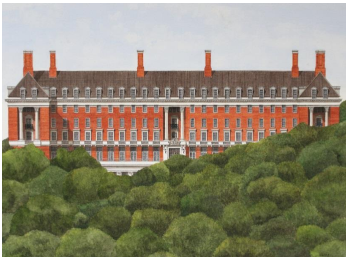
Artist Varsha Bhatia Title: The Star and Garter Size: 50cm x 70cm Medium: Watercolour Price: £2,500