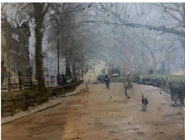
Artist Peter Brown Title: Richmond Hill, Misty March Morning Medium: Oil on Board Size: 25cm x 30cm Price: £2,700