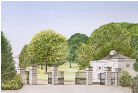
Artist Varsha Bhatia Title: Richmond Gate Size: 26cm x 40cm Medium: Watercolour Price: £600